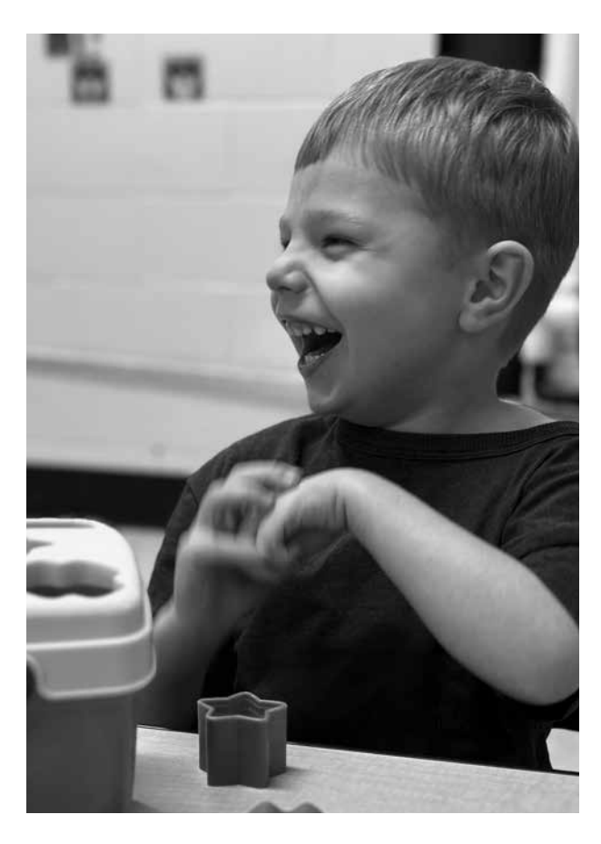
Program #243.010, 244.010 JEA Elementary School